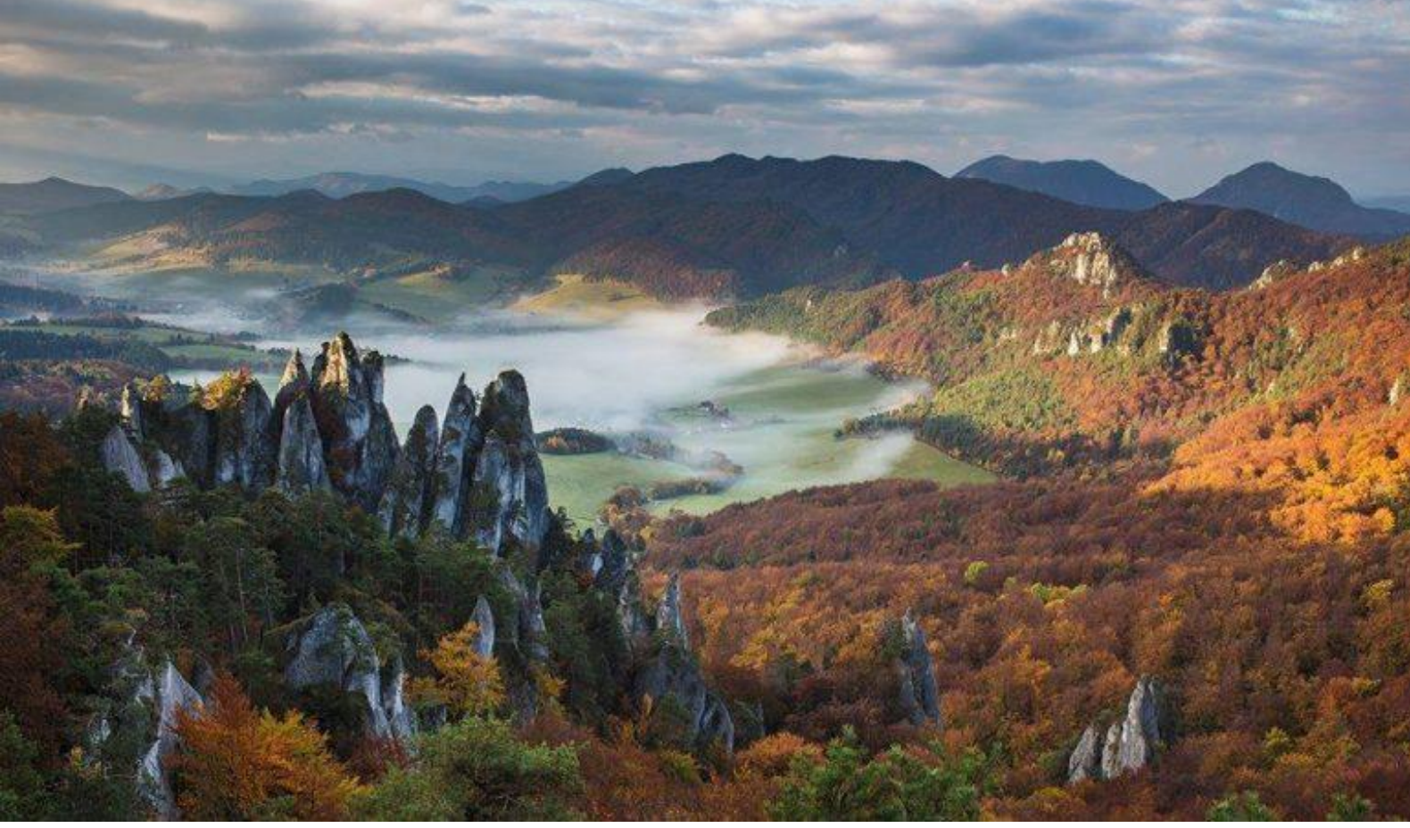
Sulovske vrchy, Slovakia